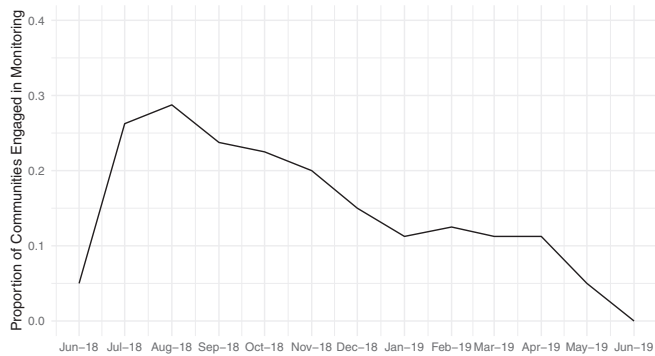
Fig. 1. Proportion of 80 treatment communities that sent monitoring data to the research team in each month of the study period. Workshops began in May 2018 and were completed by August 2018. The last month that the intervention was underway in all communities was June 2019.

facilitated by members of the research team; 2) the creation and training of a Water Committee to conduct the monitoring; and 3) communication with the research team to share collected data via WhatsApp. T2 received T1 plus monthly household visits by Water Committee members to discuss household water use.